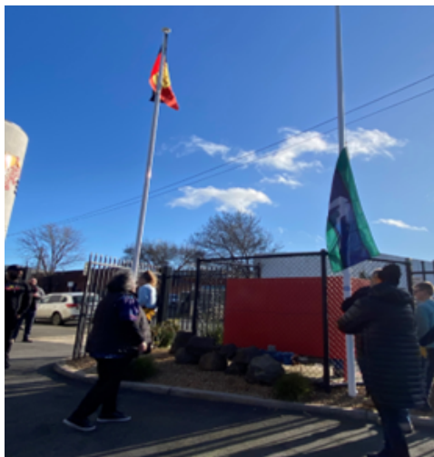
Flag raising ceremony during NAIDOC Week