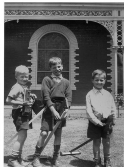
Boys with hobby horses – 1940s