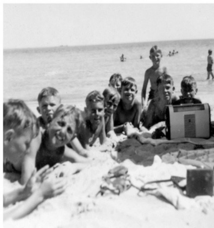
Children playing at the beach – date unknown