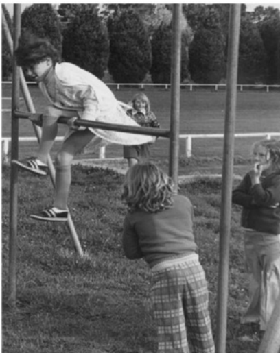
Children on the playground – Children's Home era.