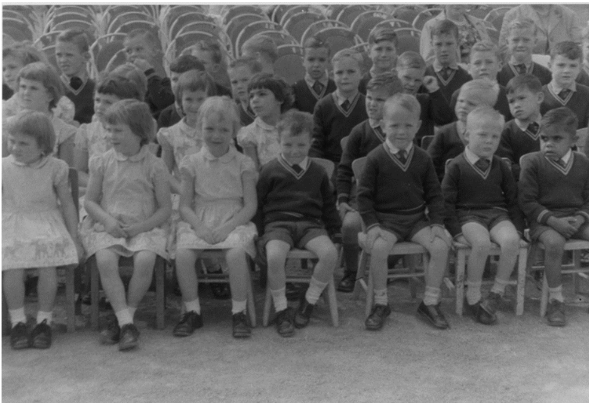
'Toddlers seated – boys in uniform', 1946 – 1954

Cafs holds many unnamed and undated photographs. Each newsletter, we'll feature a new photo in the hope that our former resident community can assist with putting names to faces.