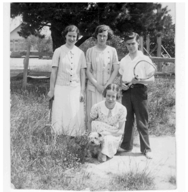
b08 pg07 a