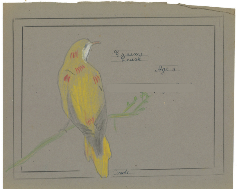
Drawing of an Oriole by Graeme Leask 97.0276 - Courtesy of Sovereign Hill