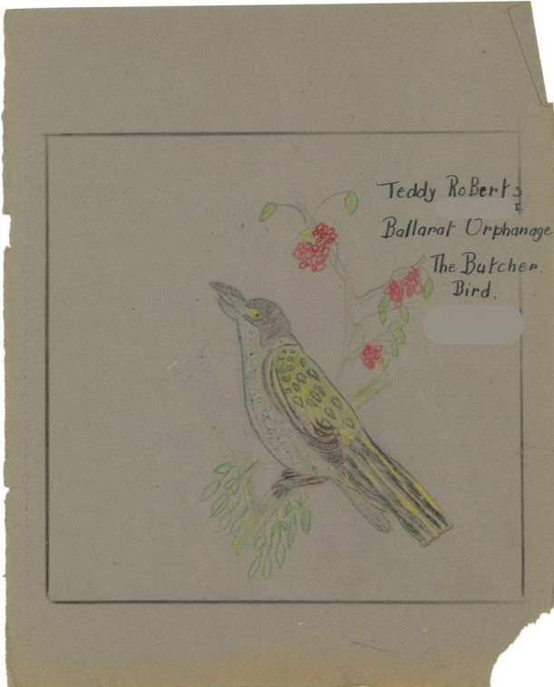
Drawing of a Butcher Bird by Teddy Roberts 97.0276