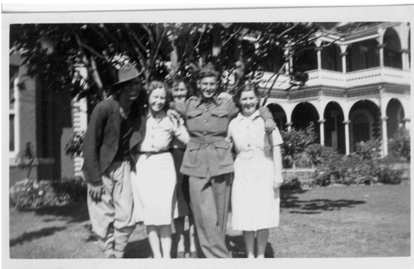
b05 pg02 e - Wartime group in front of orphanage